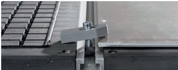
2 in 1 hybrid table